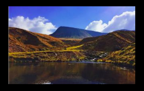
BRECON BEACONS NATIONAL PARK Ideal for hiking and outdoor adventures, just an hour away.