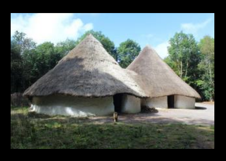
ST FAGANS MUSEUM An open-air museum showcasing Welsh life through the ages.