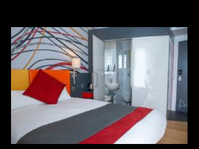
Budget: Sleeperz Hotel / 3 star hotel affordable, and centrally located. <a href="https://www.sleeperz.com/sleeperz-cardiff">https://www.sleeperz.com/sleeperz-cardiff</a>