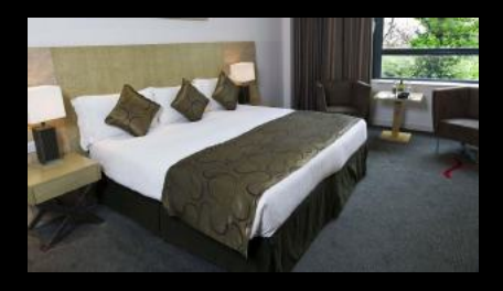
Mid-range: Park Plaza / 4 star hotel in the City Centre <a href="https://www.parkplazacardiff.com">https://www.parkplazacardiff.com</a>