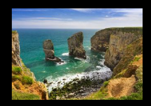
NATIONAL PARK It's one of the smallest of the UK's National Parks with beaches, estuaries, valleys and woodlands.