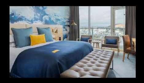
Luxury: St. David's Cardiff / 5-star hotel overlooking Cardiff Bay. <a href="https://stdavids.vocohotels.com/">https://stdavids.vocohotels.com/</a>