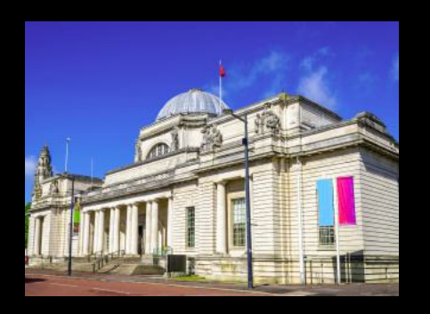
NATIONAL MUSEUM CARDIFF

A vibrant waterfront area featuring different attractions, restaurants, bars, and shops.