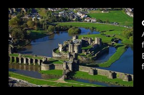
CAERPHILLY CASTLE A short drive or train journey from the city, this is one of Europe's largest medieval fortresses.