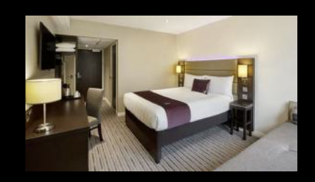
Budget: Premiere Inn in Cardiff Bay 3 star hotel located in Cardiff Bay <a href="https://www.premierinn.com/">https://www.premierinn.com/</a>