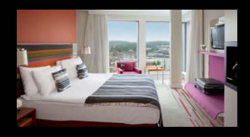
Mid-range: Radisson Blue / 4 star hotel in the City Centre https://www.radissonhotels.com/en-u s/hotels/radisson-blu-cardiff